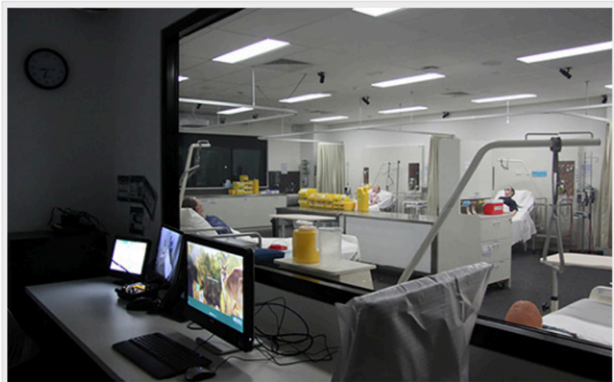
Nursing Simulation Control Room.

InDesign Technologies was recently tasked with project managing and implementing a cohesive AV system for the University of the Sunshine Coast's Nursing Simulation Space. It was a huge job across two campuses, taking in a total of seven clinical teaching spaces and 4 control rooms.